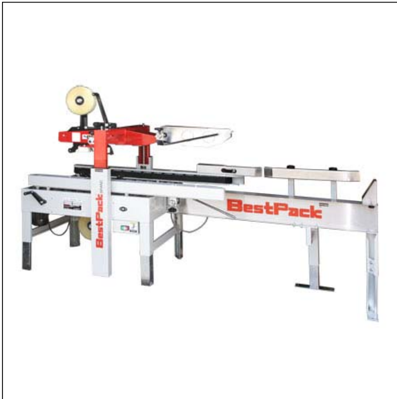
MSDBF22 Manual Side Drive