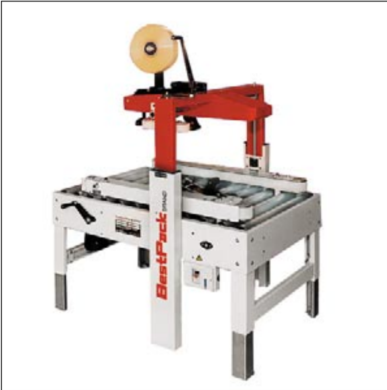
MSD22 Manual Side Drive